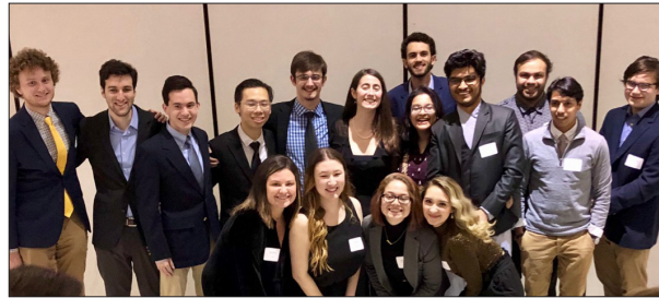
MANY OF THE STUDENTS OF THE CISLA CLASS OF 2022 AT THE SOPHOMORE BANQUET ON FEBRUARY 16, 2020.

The challenge of delivering a premier global education without international travel has required all of us in CISLA — staff and students alike — to be creative, responsive, and flexible. Thankfully, these are qualities for which CISLA scholars are well known. Not surprisingly, our current students and recent alumni from the class of 2020 have shown remarkable resilience in the face of the pandemic. In the pages that follow, we highlight our response to the COVID-19 crisis in the spheres of curriculum, internships, events, and new programming. What is less easy to capture is how the pandemic has changed our everyday lives: with the