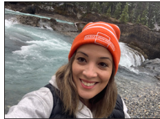
WITH NO TRAVEL OPTIONS THIS YEAR, SHE DISCOVERED HER OWN BACKYARD... THE CANADIAN ROCKIES :)

lives in Montreal and is working as an Associate Director at iV Medical Education, which focuses on creating continuing medical education programs for the healthcare community. She feels great to be doing something (however small) to help healthcare professionals.