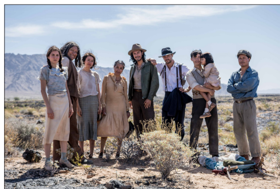
CAST MEMBERS IN THE FILM, "SONORA."