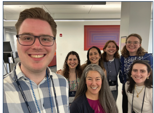
A CISLA SELFIE!