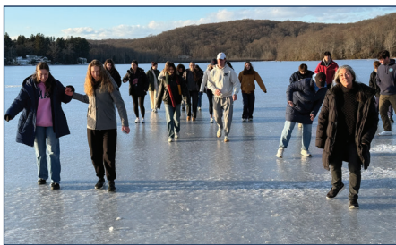
THE DAY WRAPPED UP WITH AN IMPROMPTU FROLIC ON CAMP HAZEN'S FROZEN LAKE!

OUR SECOND ANNUAL SOPHOMORE RETREAT took place on January 26, 2025 at Camp Hazen YMCA in Chester, CT. The first part of this day-long retreat involved spirited outdoor team-building activities led by Camp Hazen staff. After heading indoors to warm up over lunch, the students participated in several group dialogues to establish CISLA community norms and develop intercultural competencies around communicating across difference. The goals of this retreat are to provide an open and encouraging space for the new sophomore cohort to get to know their peers, to become acquainted with CISLA faculty and staff, and to provide a solid foundation for the students' two and a half years' learning experience in the program. We are already beginning to plan next year's retreat, and have been enjoying witnessing this event evolve and take shape.