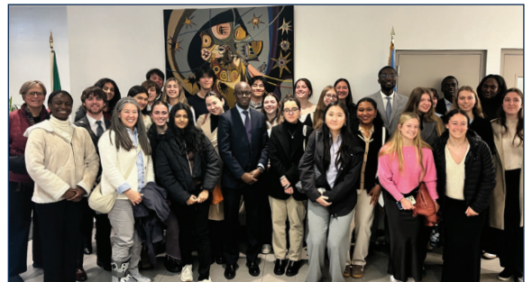
PHOTO (BOTTOM): CISLA WITH THE STAFF OF THE PERMANENT MISSION OF SENEGAL

To read the full article, please view the "Annual CISLA United Nations Trip Recap" by Evie Lockwood Mullaney, News Editor, in the April 9, 2025 issue of The College Voice : https://thecollegevoice.org/2025/04/09/annual-cisla-united-nations-trip-recap/