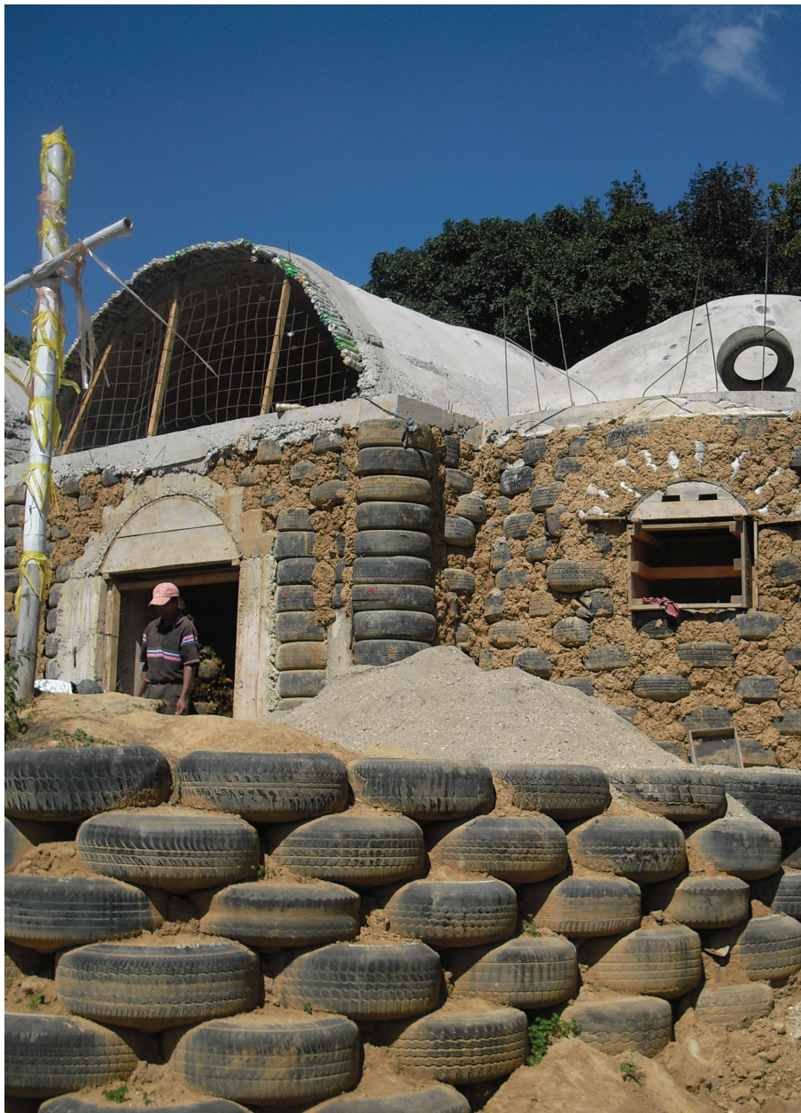
SUSTAINABLE HOMES AND SCHOOLS IN SAN JUAN COMALAPA, GUATEMALA, INCLUDE REPURPOSED MATERIALS SUCH AS DISCARDED TIRES AND PLASTIC BOTTLES