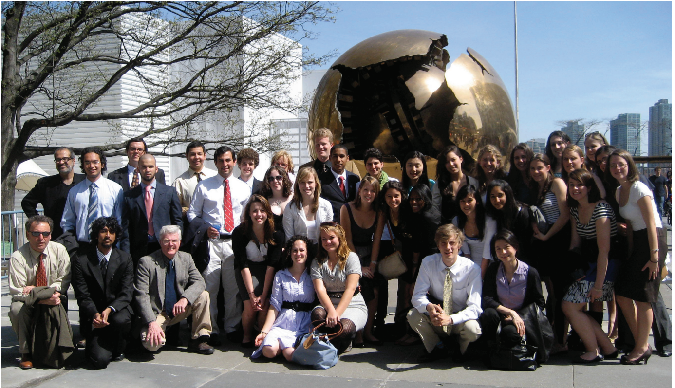
THE CISLA CLASS OF 2012 IN FRONT OF THE UNITED NATIONS DURING THE CENTER'S ANNUAL VISIT.