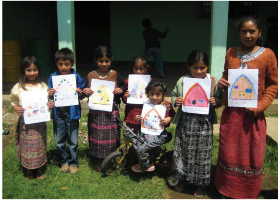
GUATEMALAN CHILDREN DREAM ABOUT THEIR NEW SCHOOL.

workers, builders, teachers and farmers. While collaboration is key to the project's success, being able to independently generate solutions has been crucial.