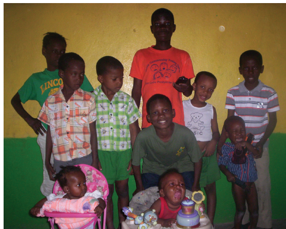
SOME OF THE CHILDREN ORPHANED BY THE JAN. 12 QUAKE WHO ARE IN THE CARE OF THE IAAC IN HAITI.